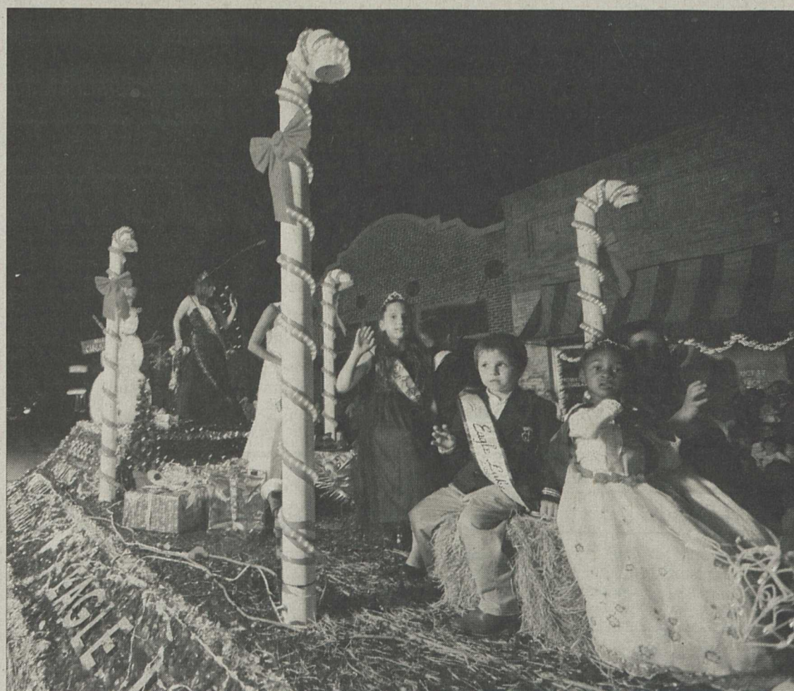
The Eagle Lake Area Royalty made an appearance at the parade.