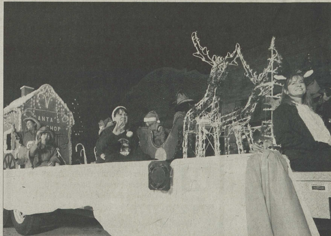
A great Christmas scene on this entry in the parade.