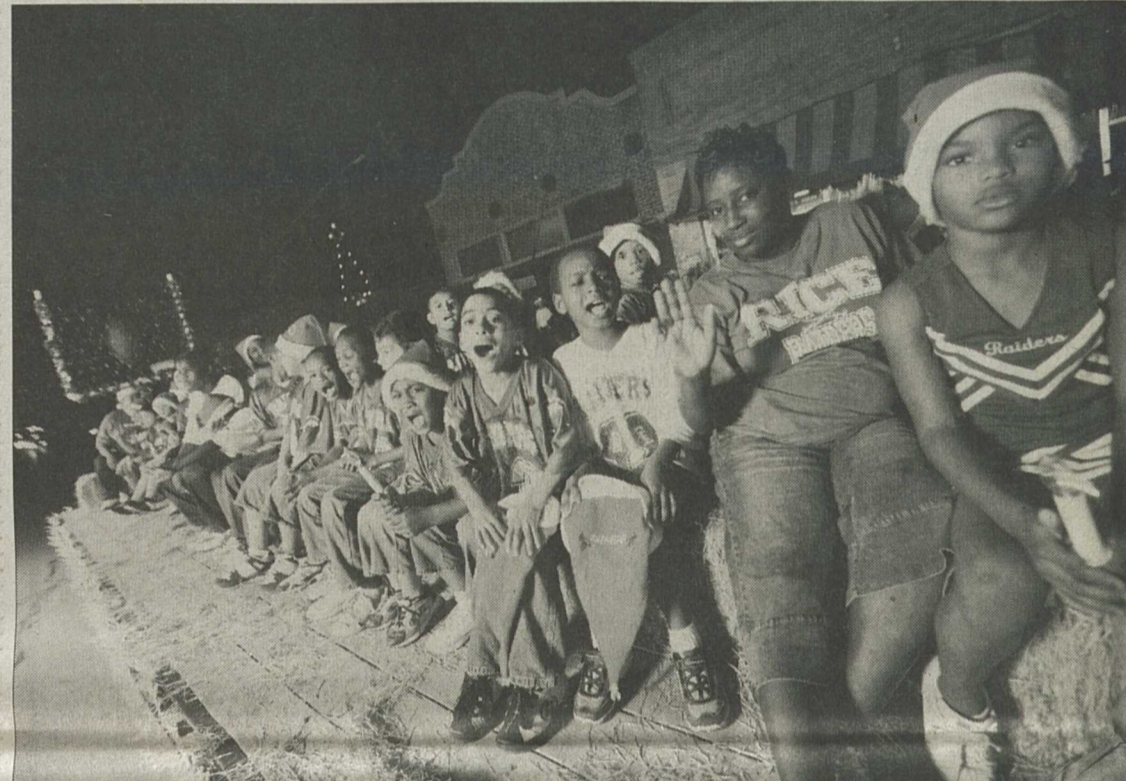
The Little Raiders entry in the Christmas parade was full of pep.